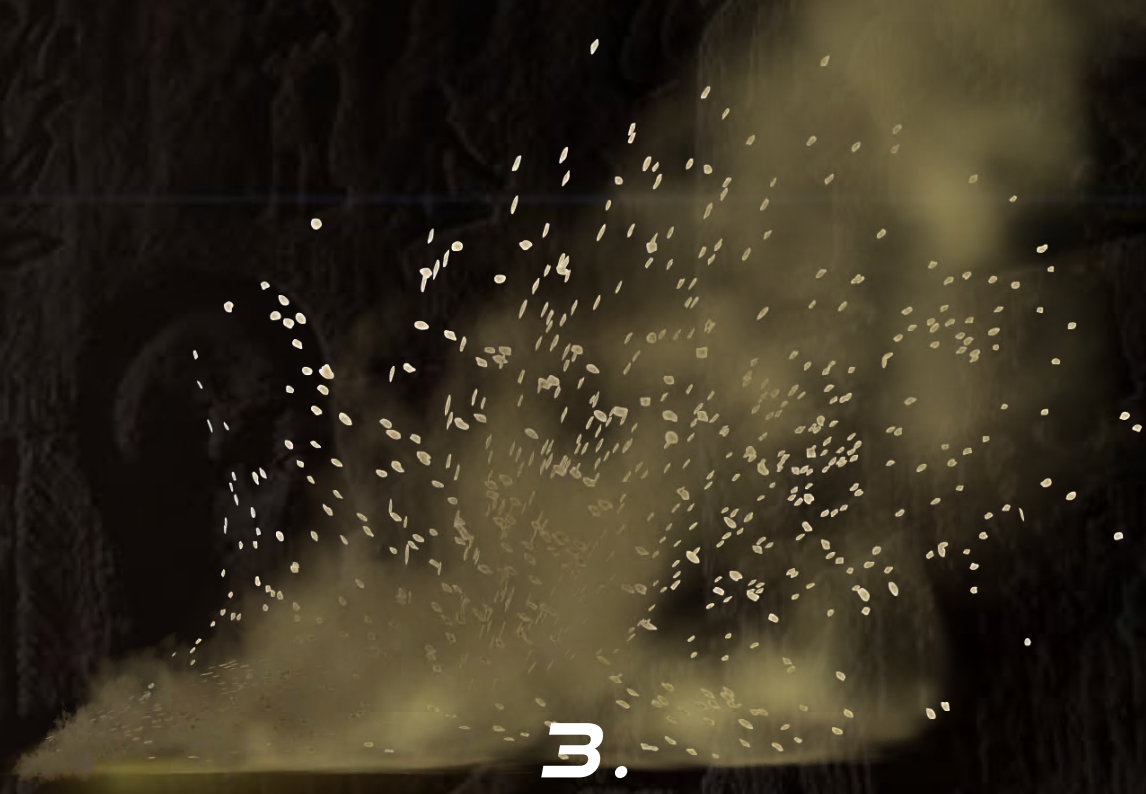
GOD BREATHING LIFE IN THE WILDERNESS