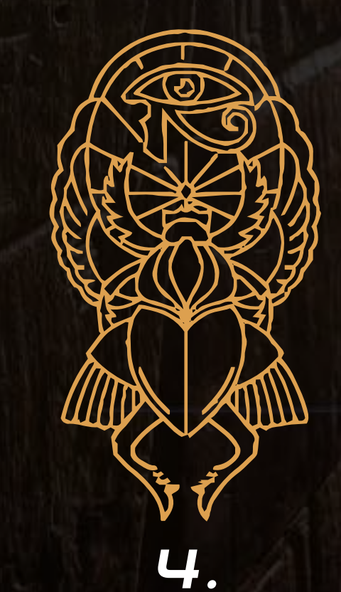
GUARDING YOUR HEART & RESURRECTION