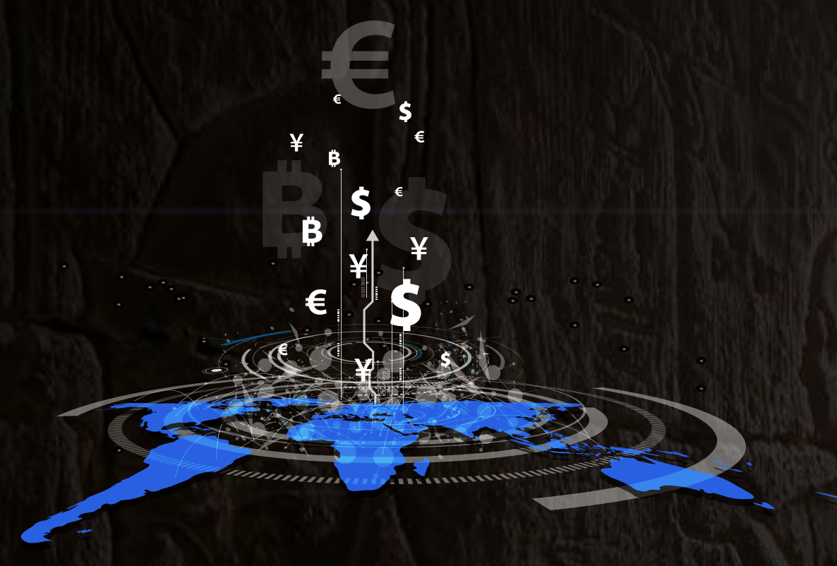
GLOBAL ECONOMIC MONETARY SYSTEM