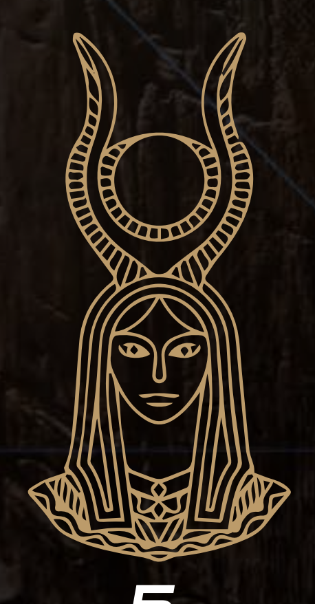
5. SEXUAL ETHIC & IDENTITY